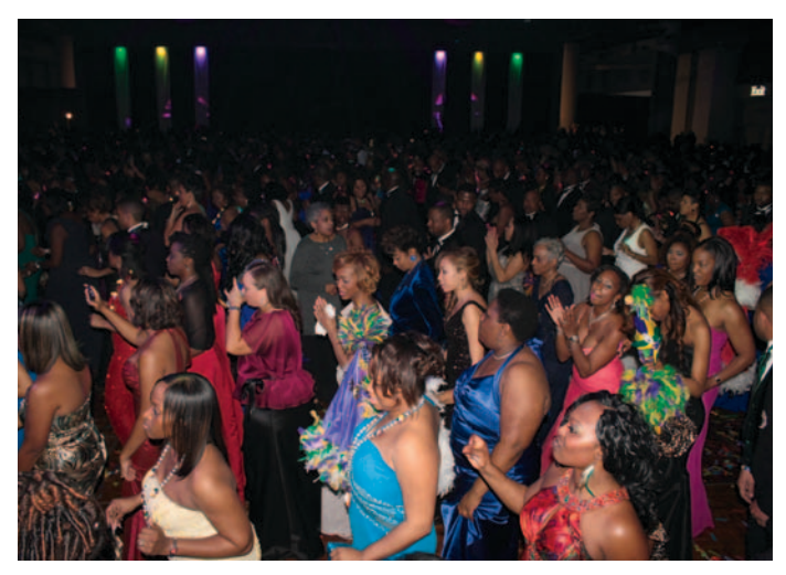
The Mobile Area Mardi Gras Association hosts several events including the annual ball and luncheon throughout the year.