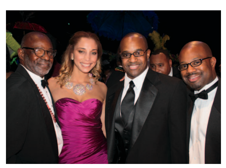
The Mobile Area Mardi Gras Association Mammoth Parade takes place at 2 p.m. Tuesday, March 4.