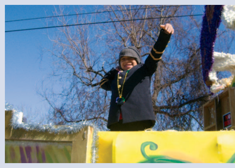
The Mobile Area Mardi Gras Association will feature about 29 floats in the Mammoth Parade on Tuesday, March 4.